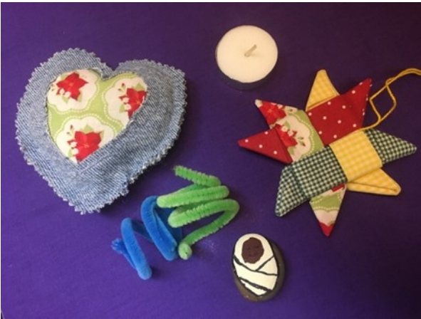
Advent Workshop participants will make an Advent Devotion Bag to use at home